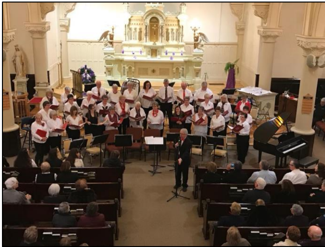
Tuesday Night Singers - Christmas Concert