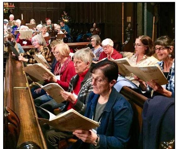
Rehearsing at Choral Fest